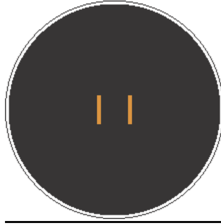
Sumo Robot (1kg Category): Game Field Setup